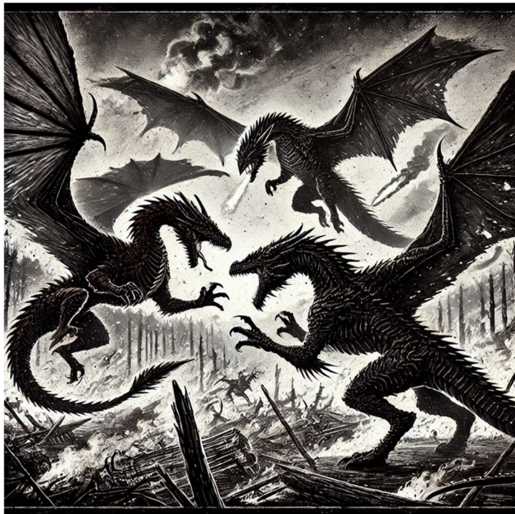
Artist's depiction of the dragon battle in the jungle.

News and events taken from around the world